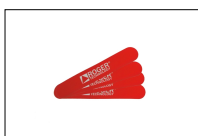
R99/BASB40 Pack of 40 stickers for barrier.