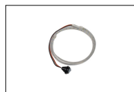
BI/BLED/6/RGB Multicoloured RGB LED strip (red, green + other colours) with connection cable for BI/004HP - BI/006 barrier header.