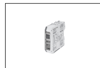
DLD2/24 Loop detector for 2 loop, 2 output + output alarm, 24V AC/DC.