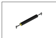
SP/83/01 Spring diameter 83 mm for barriers.