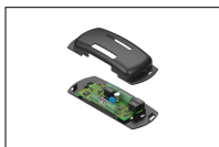
B73/LTM RGB boom light and traffic light control device for CTRL.