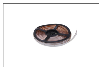
ALED/6C 6-metre LED strip with connection cable for barrier boom (red colour).