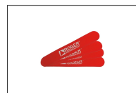
R99/BASB20 Pack of 20 stickers for barrier.