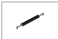
SP/85/01 Spring diameter 85 mm for barriers.