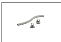
KT242 Cable passage kit with magnetic support for barriers.