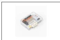
B74/BCONNECT vers. HW2 Module Wi-Fi B-CONNECT - Remote management and programming system in IP web browser mode via Wi-Fi hot spot P2P connection for Brushless control units (B70/2ML - EDGE1 - CTRL - B70/1DC - B70/1DCHP - B70/1T - B70/1THP - F70/IPU36).