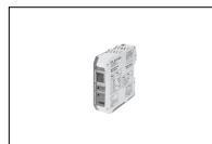
DLD1/24 Loop detector for 1 loop, 2 output, 24V AC/DC.